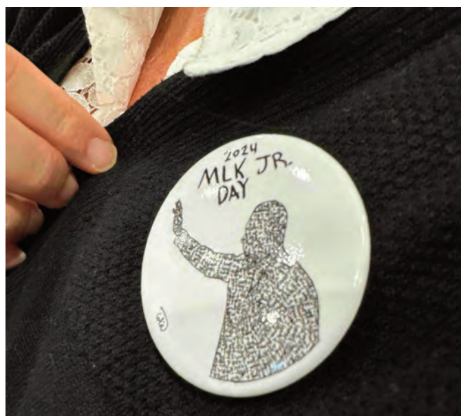
(Left) A staff member from Open Sky Community Services highlights the pin received at the 39 th Annual Community Breakfast honoring Dr. Martin Luther King Jr. at Assumption College. (Top right) The Pine Street Inn staff choir performed "Lift Every Voice and Sing" on MLK Day. (Bottom right) Youth leaders from Children's Services of Roxbury's Youth, Purpose and Partnership program assemble care packages for local shelters.

In January, numerous members of the Providers' Council celebrated the life and legacy of Dr. Martin Luther King Jr., from hosting events honoring the civil rights icon to volunteering in their communities.