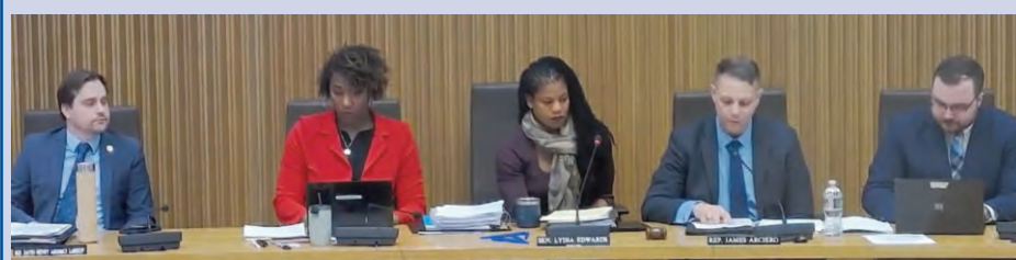
The Joint Committee on Housing hears testimony regarding The Affordable Homes Act.

Continuing its advocacy efforts to better the lives of the human services workers in Massachusetts, the Providers' Council submitted testimony to the Joint Committee on Housing in January in support of Gov. Maura Healey's $4 billion housing bond bill.